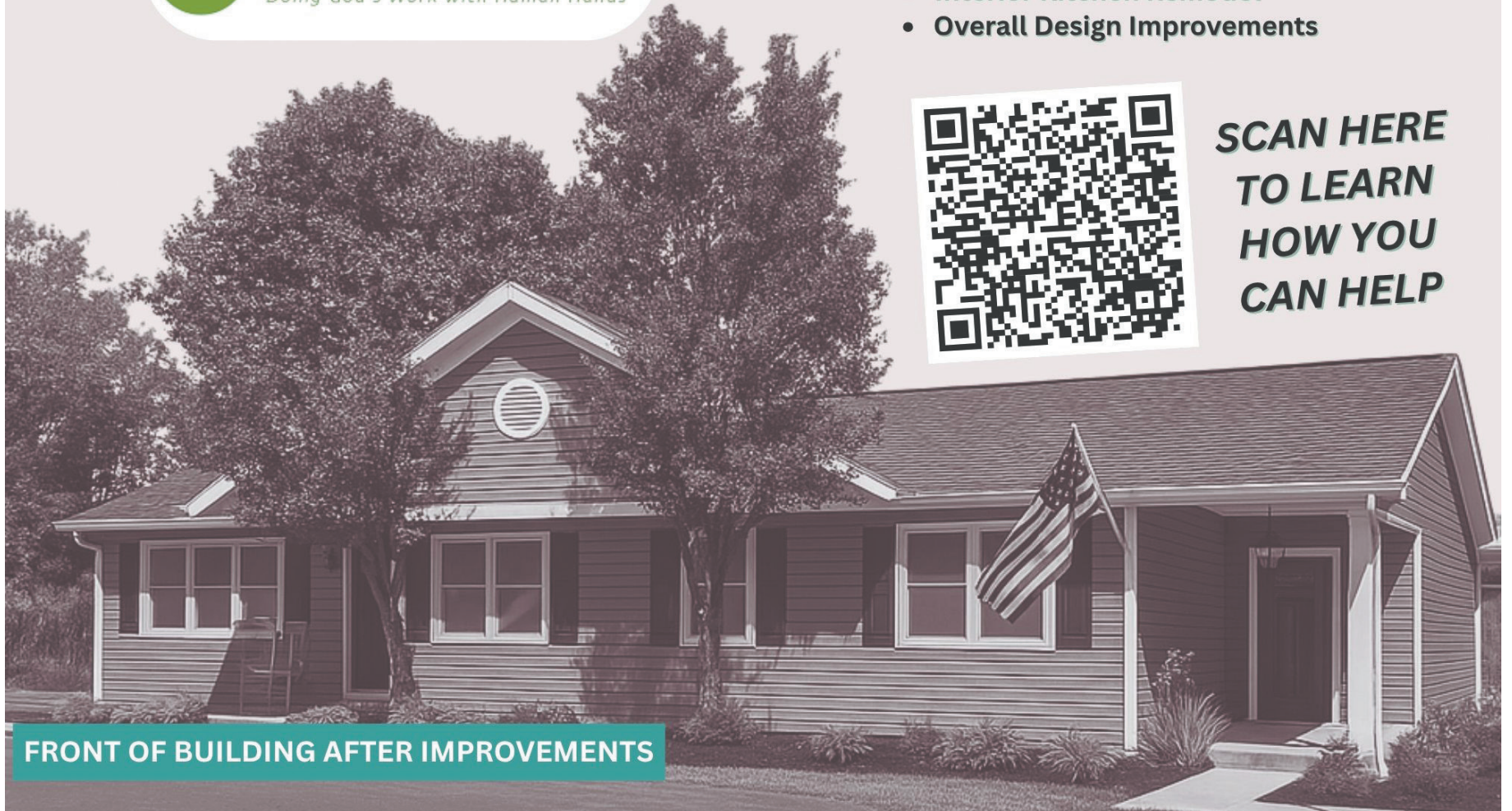
FRONT OF BUILDING AFTER IMPROVEMENTS