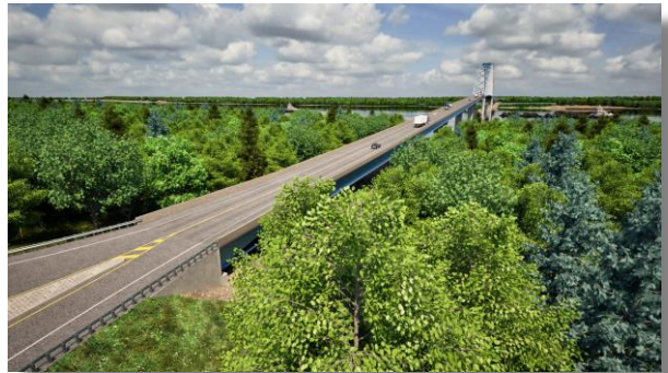
Rendering of approach view of new US 51 Bridge

US 51 Bridge Replacement: Supports the need for this bridge replacement from Cairo to Wickliffe as a shared project between IL and KY. This project is currently in the design phase, with construction to tentatively begin in 2028. Approximate total cost $400 – 450 million.