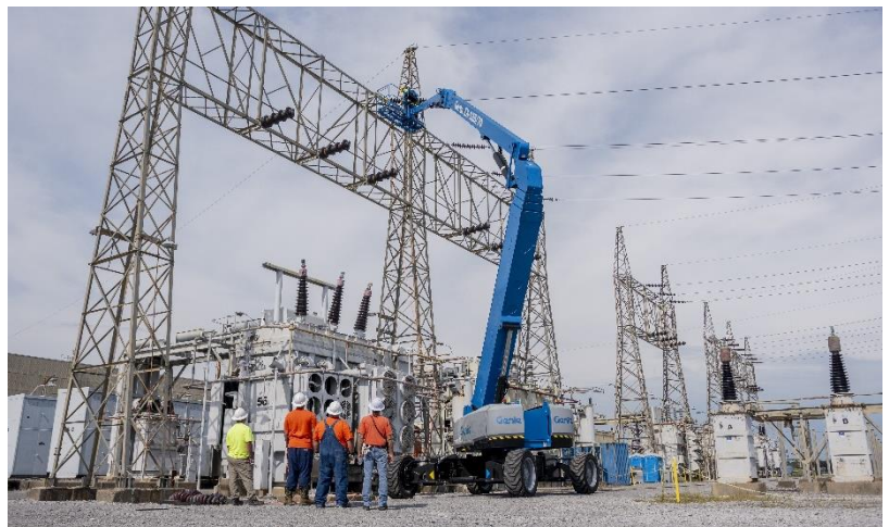
Switchyard cleanup at the site.

Thank you for including report language in both the House and Senate bills that highlight this need.